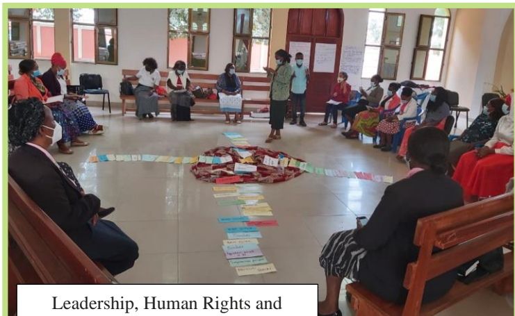
Leadership, Human Rights and Gender Equity workshop in progress

AMSF was pleased to send $20,000 in October to support the continuation of the impressive new education program of the IECA Women's Association, developed in response to the challenges of COVID 19. The courses range from vocational training in mask making and soap production, to seminars on how to raise awareness of gender-based violence (heightened during the economic and social strains of the pandemic), women's rights, ways to prevent this kind of violence and how to act if it happens. The usual entrepreneurial courses such as Pastry making for small businesses, and Literacy classes for women and men, also continue. We rejoice in the blessing of being able to support the full-out efforts of the IECA Women's Association to educate and support social cohesion in the face of the pandemic.