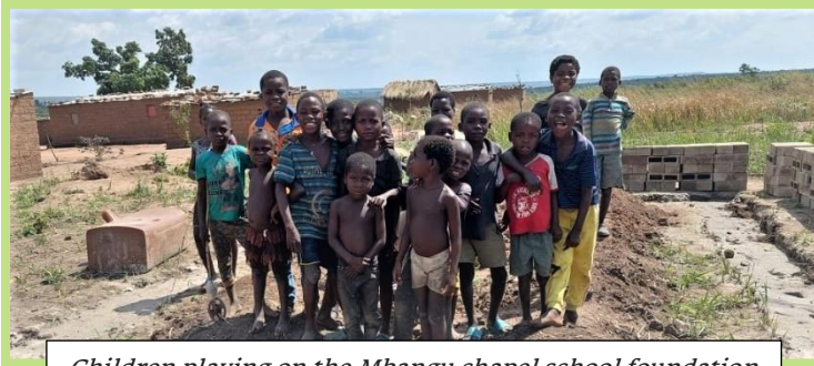
Children playing on the Mbangu chapel school foundation