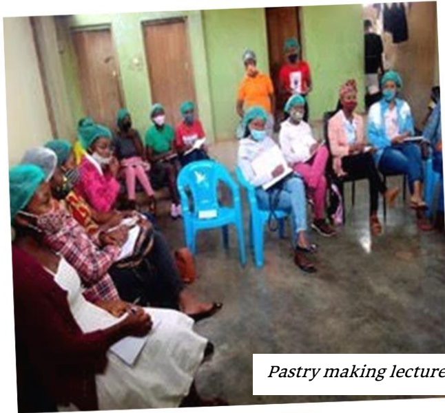
Pastry making lecture