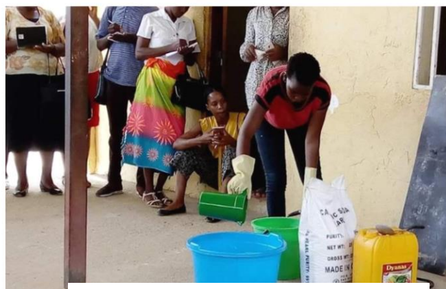
Note-taking, soapmaking demonstration

The recent education program of the IECA Women's Association, supported by the US$20,000 AMSF grant, addresses issues heightened by the pandemic that touch women world-wide.